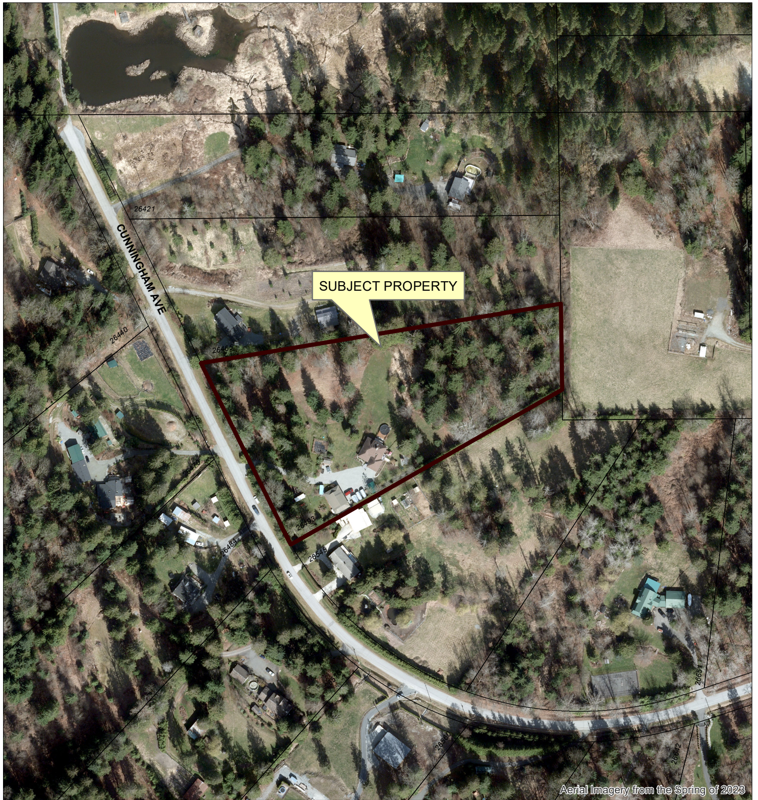
Aerial Imagery from the Spring of 2023