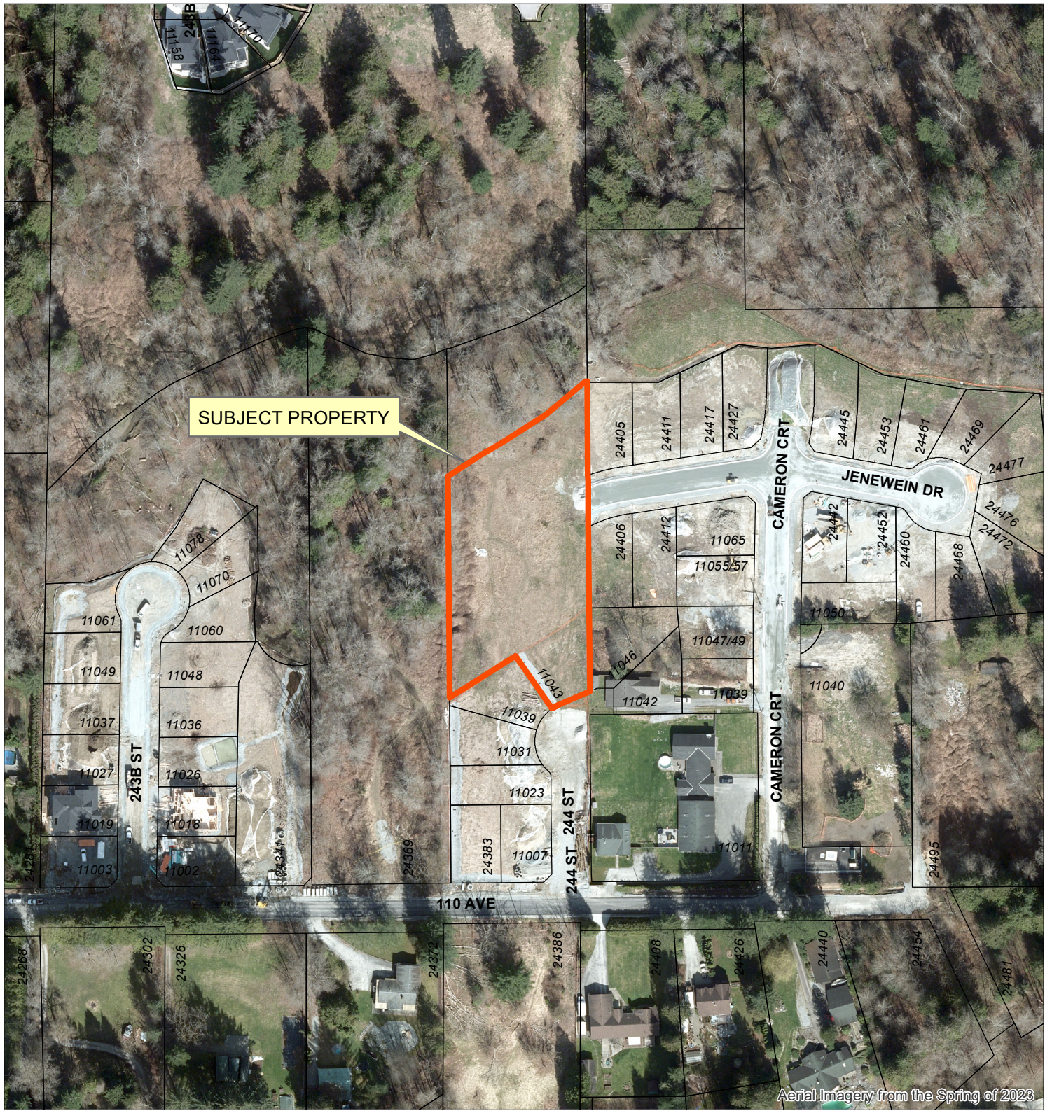
Aerial Imagery from the Spring of 2023