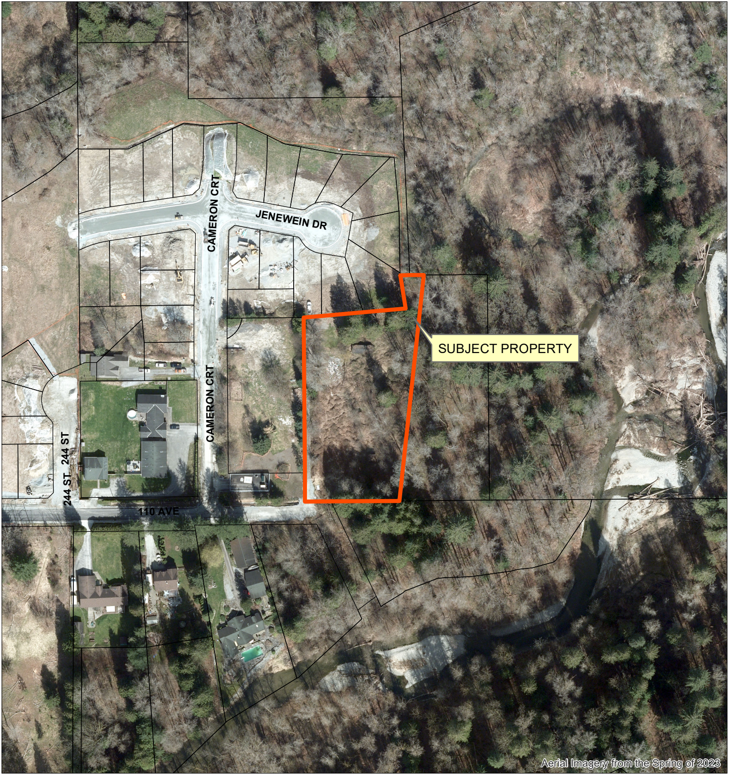
Aerial Imagery from the Spring of 2023